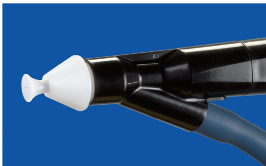
Vantage® manual spray gun provides highly efficient, flexible and reliable operation.