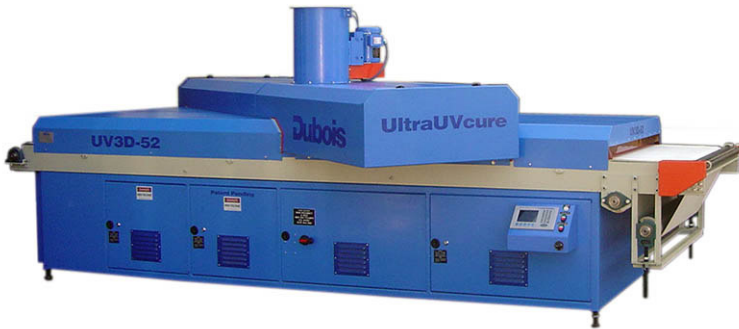
UV3D-52 UV Oven