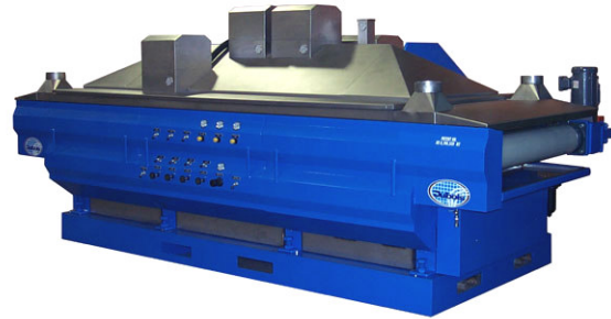
UVS-24 w/out Exhaust System

Dubois Equipment produces a complete line of Mist Coaters™ that are specifically designed for the application of 100% solids UV coating to 3-dimensional contoured parts. There are many benefits associated with the application of 100% solids UV coating, some of which are shown below: