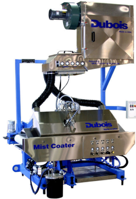
UVS-12 w/Exhaust System