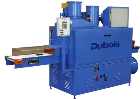
UV3D-12 UV Oven

Dubois Equipment produces a complete line of 3-dimensional UV ovens. The Dubois 3-D UV Oven is the result of designing a machine from the ground up to properly cure three-dimensional substrate. By providing both equal dose and peak intensity to all surfaces of the substrate, the most efficient cure is obtained. This breakthrough design provides for lower coating cost, lower energy consumption, improved coating performance, and elimination of safety issues due to uncured edges. This proven technology has greatly enhanced the energy efficiency, safety, and overall performance of UV coating systems.