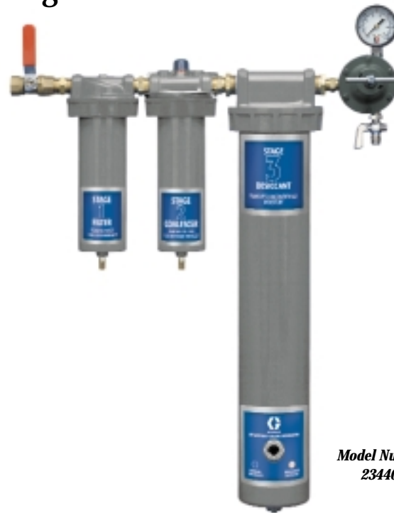
Model Number 234401