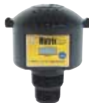
Tank Level Monitor