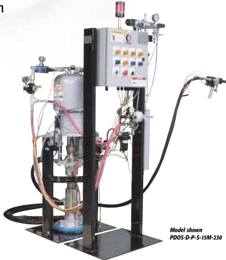
Model shown PDOS-D-P-S-15M-230

The most complete system for dispensing sealants that use booster paste to speed cure of structural sealants.