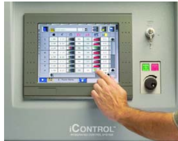
Application parameters include flow and atomizing air, electrostatics settings, and settings for gun triggering.

Gun control is easy in either manual or automatic mode allowing control of flow rate, atomizing, KV and current for individual guns, or all guns through use of the “copy all” function. Similarly for gun status, individual guns or all guns at one time can be viewed to display gun parameters and presets for various part styles.