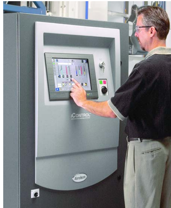
The iControl® system gives powder coaters enhanced capabilities for optimal system performance and maximum line efficiency.

For reciprocator control , features include user-programmable presets for variable-stroke speed and variable-stroke length. Reciprocator control provides additional flexibility and greater control for varying part heights and part speeds.