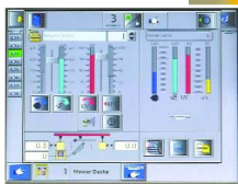
By measuring and controlling airflow, the iControl® system provides stable air input to the pump and therefore more consistent powder flow.