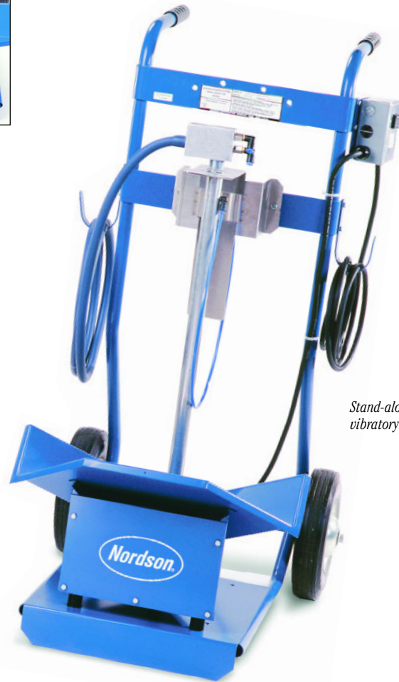
Stand-alone configuration of vibratory box feeder system.

Must specify by system part number or configuration code when ordering.