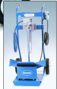
(inset) The stand-alone configuration can be used with a wall- or booth-mounted gun and control, or as a bulk transfer system to a larger delivery hopper.