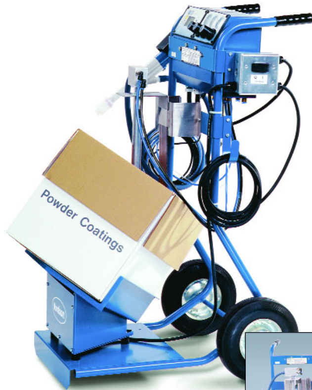
(above) The Nordson box feeder system pumps powder directly from shipping containers for faster replacement or color change.

The Nordson box feeder system is ideal for all coating operations, especially those requiring frequent color changes, and can be used with cartons from 25- to 55-pound (11- to 25-kg) capacity. It is designed for use with all Nordson spray gun and control units.