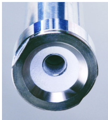
Powder is fluidized as air passes through a small porous disc at the bottom of the outer pick-up tube.

Nordson’s innovative fluidizing-assist design features a small porous disc at the bottom of the outer pick-up tube that passes just enough air to provide local fluidization. The small amount of air used in the system is drawn up the inner pick-up tube with the powder, preventing powder from drifting out of the box as seen with conventional fluidizing-assist designs used in other conventional box feeder systems.